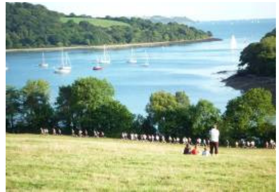
Above: Runners at the 2007 race

The Trelissick Estate will once again host an exciting early evening 10k race this August. The event, now entering its second year will follow the same route as this winter 10k race, taking in the beautiful woodlands and fields overlooking the breathtaking Fal Estuary.